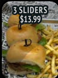
3 SLIDERS $13.99