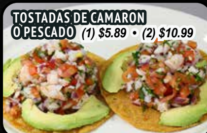
TOSTADAS DE CAMARON O PESCADO (1) $5.89 • (2) $10.99