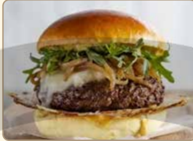
GRILLED CHICKEN SANDWICH $8.99 With lettuce, tomato & french fries Add Ranch 85¢

Butchers cut beef patty, eats like a steak, topped with grilled onions, lettuce, tomato & pickles, smoked gouda cheese over a crisp house cheese on a brioche bun. $13.99