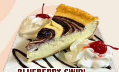
BLUEBERRY SWIRL CHEESECAKE $6