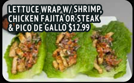
LETTUCE WRAP W/ SHRIMP, CHICKEN FAJITA OR STEAK & PICO DE GALLO $12.99