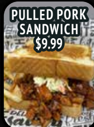
PULLED PORK SANDWICH $9.99