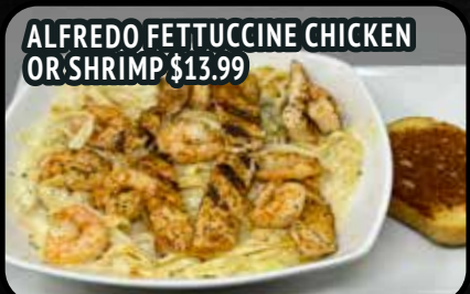
ALFREDO FETTUCCINE CHICKEN OR SHRIMP $13.99