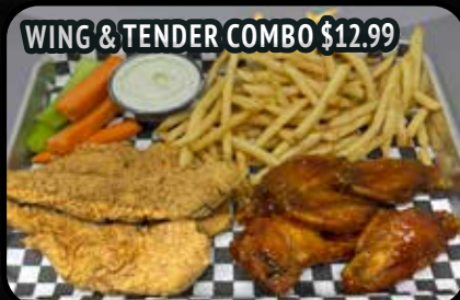
WING & TENDER COMBO $12.99