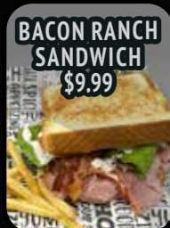
BACON RANCH SANDWICH $9.99