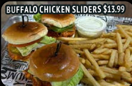
BUFFALO CHICKEN SLIDERS $13.99